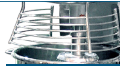
▶ Safety Guard

This mixer has 3 speeds. It comes complete with 3 attachments, a stainless steel bowl, and a safety guard